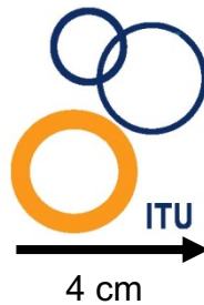
Diagram 3. ITU Logo Layout

6.6. Diagram 3 above shows the correct layout for the ITU Logo: