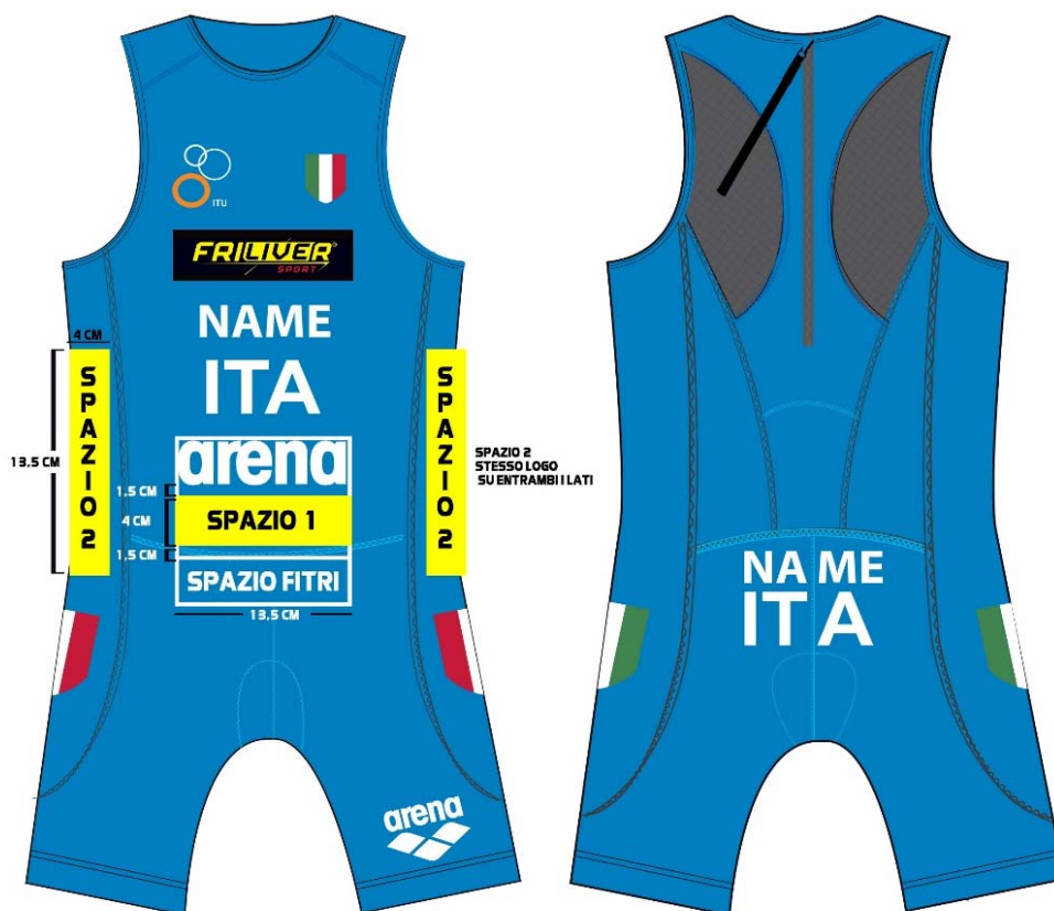
Figura A.: body squadra nazionale 2018

Il secondo spazio è quello disponibile sui fianchi del body sia a sinistra che a destra. E’ possibile inserire solo uno sponsor che sarà così ripetuto sui due lati. Le dimensioni da rispettare sono: altezza 13,5 cm e larghezza 4 cm.